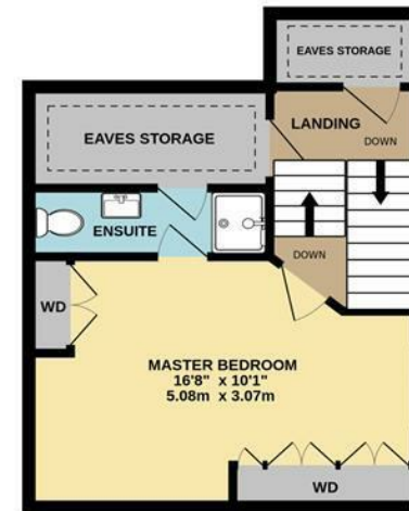
2ND FLOOR 337 sq.ft. (31.3 sq.m.) approx.