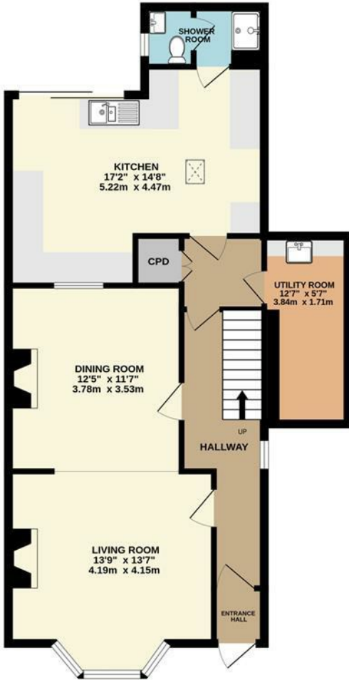
GROUND FLOOR 739 sq.ft. (68.6 sq.m.) approx.