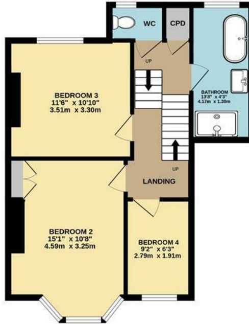
1ST FLOOR 507 sq.ft. (47.1 sq.m.) approx.